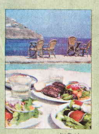
On Mykonos, lunch at a cliffside cafe comes with a view of Super Paradise Beach.

Lazy days on this seductive, decadent Greek isle define the phrase 'getting away from it all.' L6