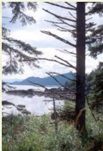
(ENLARGE)

Tlell, British Columbia – An oversize flat-screen television doesn't belong in a log house.