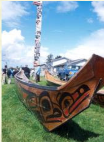
STEVE HAGGERTY/ColorWorld ( ENLARGE )

Visitors to Skedans, in Gwaii Haanas National Park Reserve, show their park passes and sign in before joining a tour of the village site and totem poles.