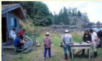
( ENLARGE)

You can take a cruise or hire a fishing charter at the harbor in Queen Charlotte City.