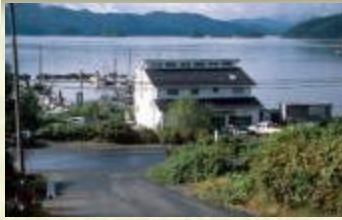
( ENLARGE)

You can take a cruise or hire a fishing charter at the harbor in Queen Charlotte City.