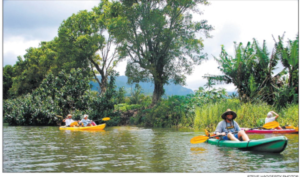
There's enough room in the Hanalei River for bird watchers, novice paddlers and beginners.