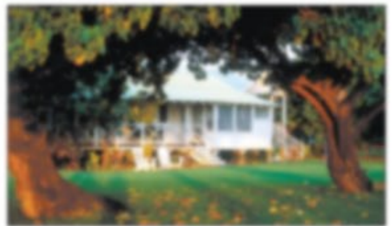
Waimea Plantation Cottages on Kauai features refurbished former sugar-plantation houses.