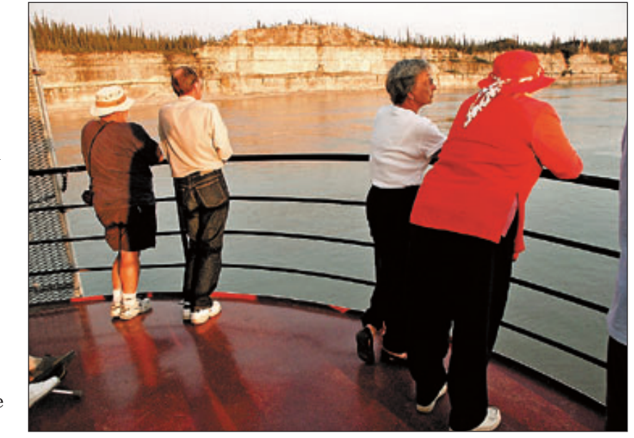
The Norweta, docked at Fort Providence in Canada's Northwest Territories, offers eight- and 10-day cruises on the Mackenzie River.

At 11 p.m., the midnight sun colors the walls of the Ramparts river gorge a deep gold.