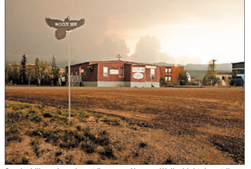
Smoke billows from forest fires near Norman Wells. Lightning strikes in the region cause 30 to 40 fires per year.