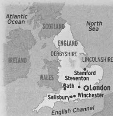
GREG GOOD/SUN-TIMES GRAPHIC

shot in two general areas: Derbyshire and Lincolnshire, in the East Midlands (on a map, look east of Liverpool); and southern England, between Bath and Salisbury. If you have difficulty locating these sites in an atlas, order the official "Movie Map" (see accompanying If You Go); it simplifies the planning. The Internet is also a good source of information, with a veritable wish list of tours and day trips offered by local companies.