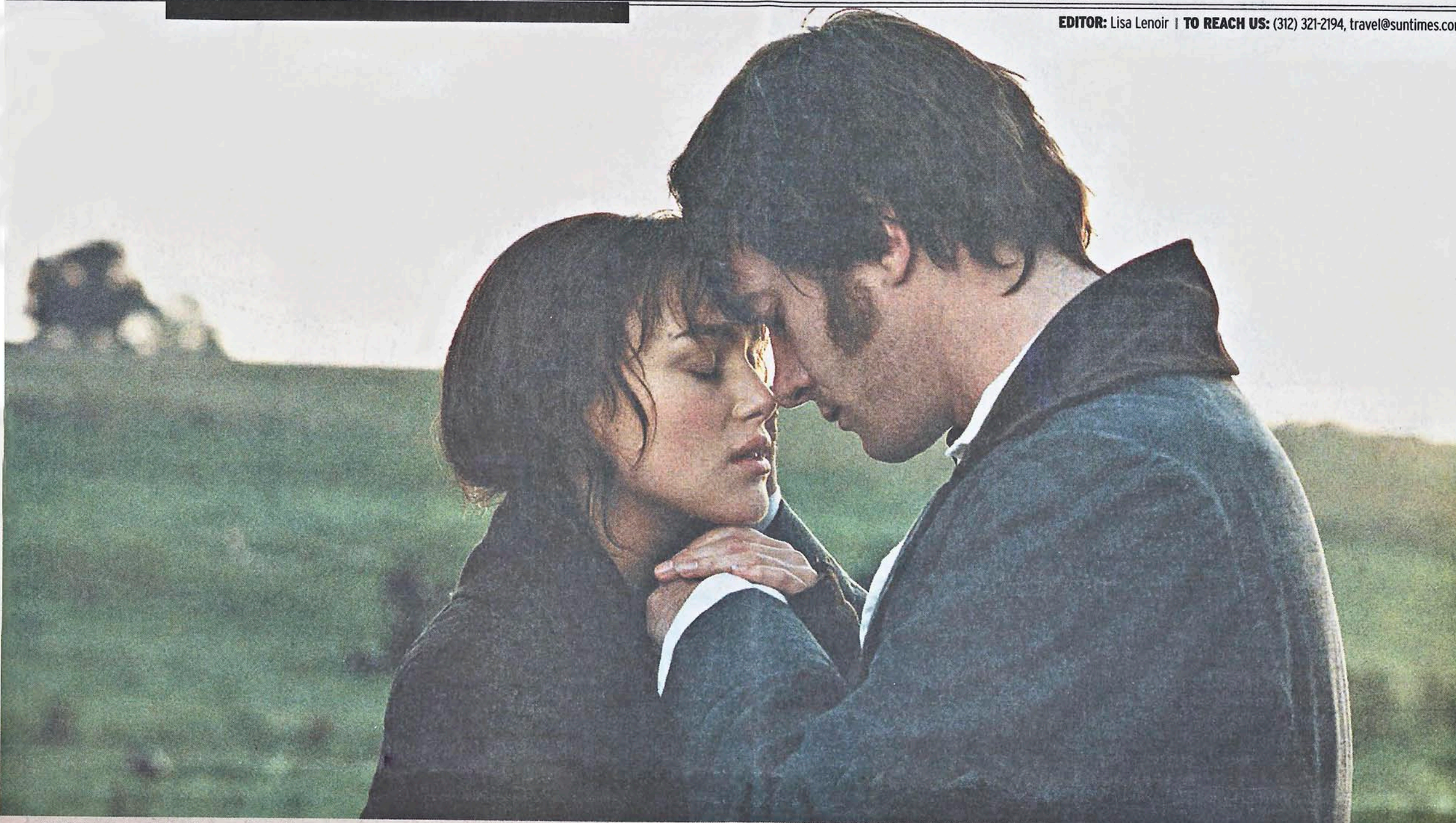
ABOVE: Keira Knightley and Matthew Macfadyen star in "Pride & Prejudice," based on the novel by Jane Austen. BELOW: Jane Austen's home from 1809 to 1817 in Chawton, Hampshire, England.