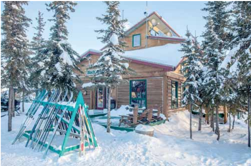
Power from solar panels, a wind turbine, five sets of batteries and a generator makes the lodge self-sufficient.