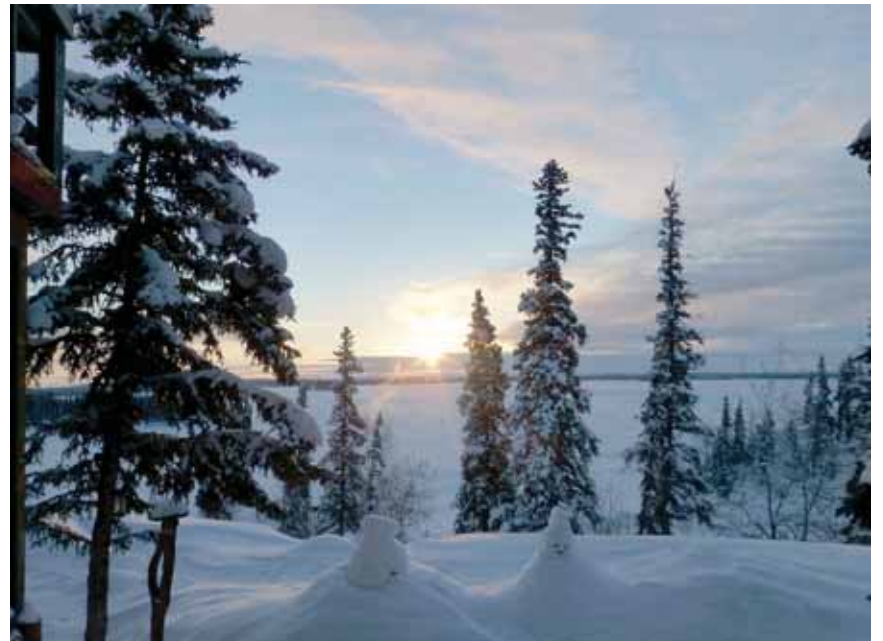
The winter sun on the eastern horizon greets early risers at Blachford Lake Lodge, Canada's Northwest Territories.

all. There were no elevators or silk draperies, no crystal chandeliers or marble-tiled bathrooms. Minibars and television were absent, as was 24-hour room service, air conditioning and less than high-speed Internet access. With no roads, cars were irrelevant. After a brief mental reboot, we realised we didn't miss any of them.