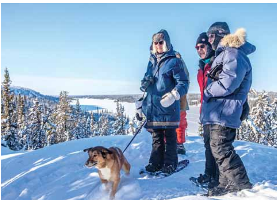
Pete the dog smells a rabbit, but the cliff is steep. The solution: back on the leash, just in case.

The lodge is open in summer and winter, as long as the ski-float plane is able to land, on solid ice or open water. Each of the five rooms and five cabins at Blachford Lake Lodge is outfitted to sleep four or more, in king, queen and/or bunk beds. Child rates are available, depending on the season and dates. All rates include excellent cuisine served buffet-style; two chefs prepare everything on site, from breads to salads and main dishes. Summer activities include kayaking, canoeing, swimming and hiking. Plan to take a commercial flight to Yellowknife and spend your first night there. For details and suggestions, go to www.blachfordlakelodge.com