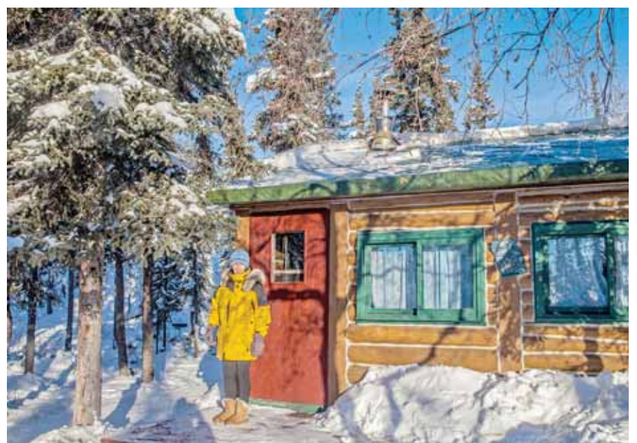
Guests in Raven's Roost cabin, which sleeps four, feel like pioneers, but warmer and more comfortable.