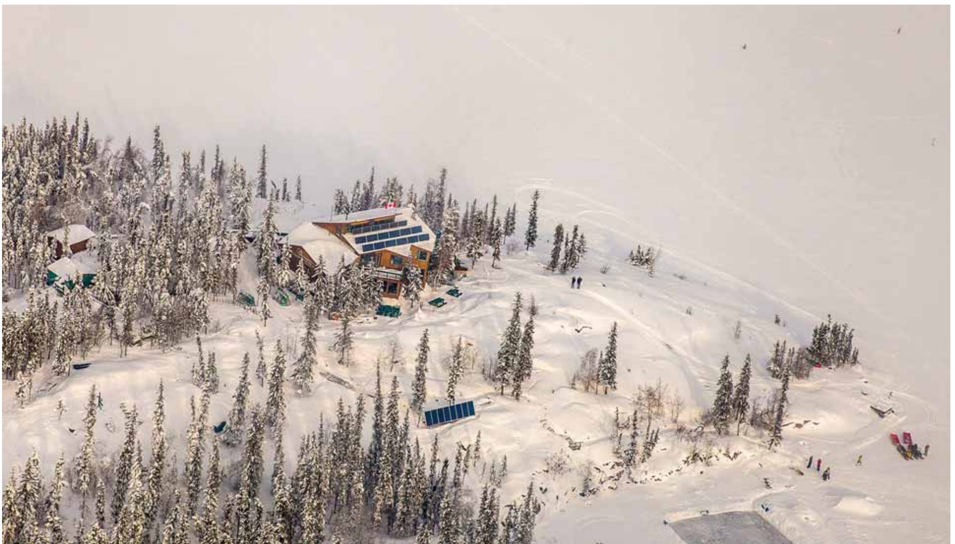
Off-the-grid lodges, like Blachford Lake Lodge, need a lake, for float and ski plane deliveries, piped water and sports activities.