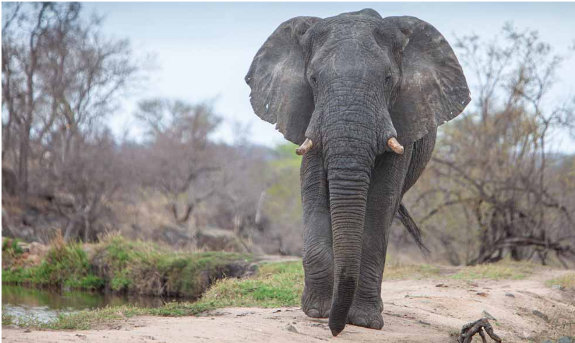
WILD LIFE: Size matters when two forces meet. Flapping ears tells us to back off and give him space at the South Luangwa National Park, Bushcamp Company, Mfuwe, Zambia.