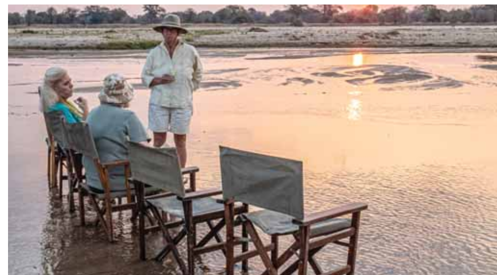
PICTURESQUE: The evening sundowner in the Luangwa River, barefoot, with the Chinden Hills in the background is a view of thousand dollars.