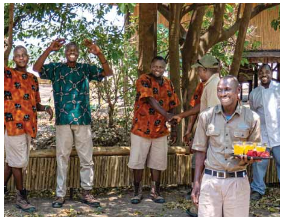
WARM WELCOME: The Bushcamp Company's Chamilandu Lodge staff brings out the welcome mat.

too funny," he said, shaking his head, chortling just as we spotted a pair of hyenas.