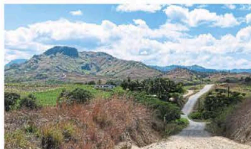
The Nausori Highland Road, scaling ancient lava slopes, reveals the origins of Fiji's birth.

"Let me know the next time you travel. I might decide to come along." – Tribune News Service