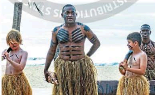
Young travellers joining Fijian warriors at a traditional torch-lighting ceremony on the beach.