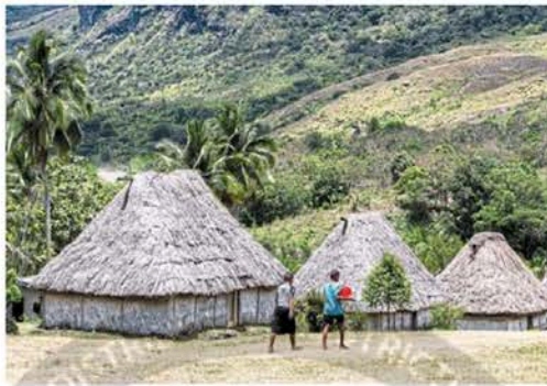
Navala Village, Fiji's last traditionally thatched village, is an hour from the Fiji Orchid Hotel and welcomes visitors.

leading the way to the school and church.